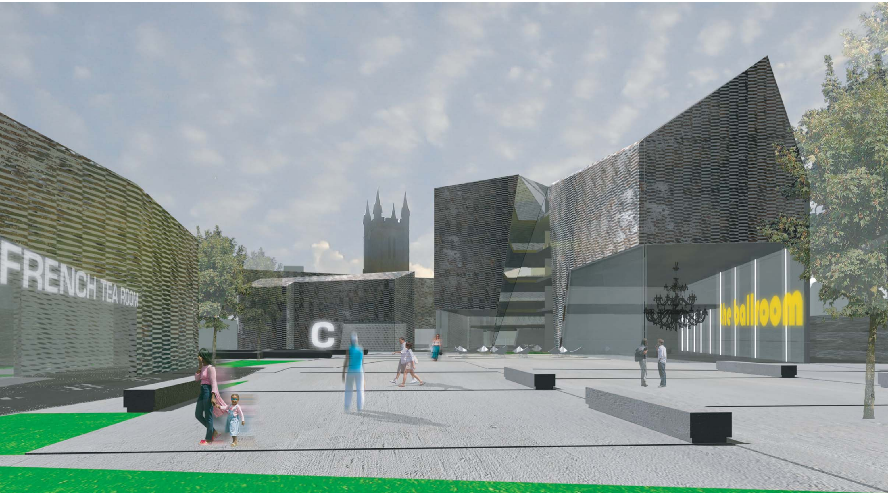
03 >> FRENCH QUARTIER PORTARLINGTON

Our proposal indicates the necessary intensity of overlapping urban forms, through the proximity of each individual building to the next. This is important, in so far as any successful urban area must have a certain scale and density to allow them to be cohesive in urban design terms and have enough variation to make them flexible.